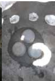
Mariner with 3 pearls