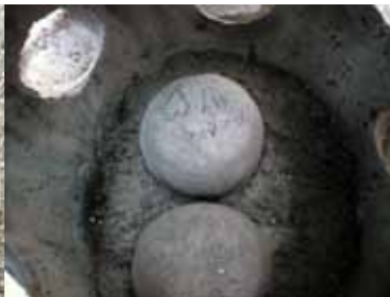
Nautilus with 2 pearls