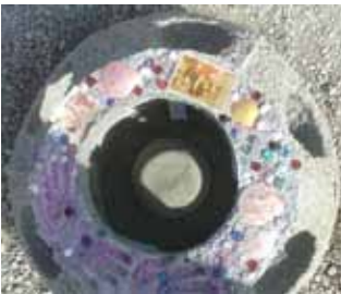
Aquarius with a single pearl

The casting is performed in the community near the designated reef site. Eternal Reefs brings a pre-cast Reef Ball to the casting site where you have the opportunity, if you wish, to mix the remains into concrete to form a “pearl.” The pearl is a center piece that fits inside the Reef Ball and is set aside to cure overnight.